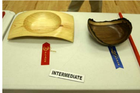
Mark Couto 1 st and 2 nd places in the Intermediate Cat.

The Club Competition for April had only a few but some good entries to be judged. The results were: