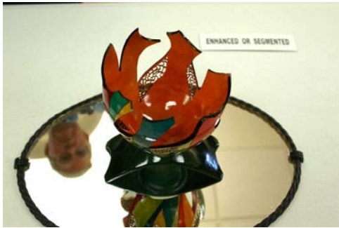
Worth Barham 1 st place – Enhanced Cat.