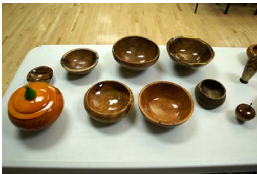
Worth's bowls – first half