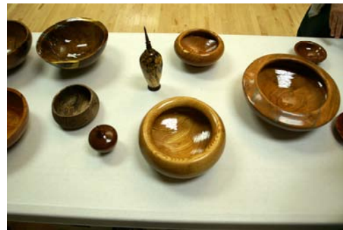
Worth's bowls – second half