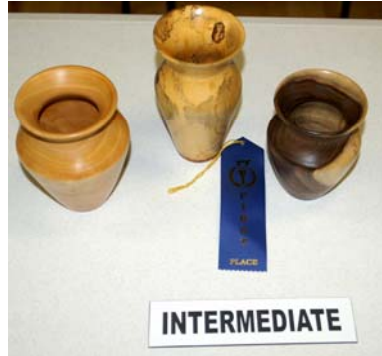
Kevin Felderhoff – First in Intermediate Cat.