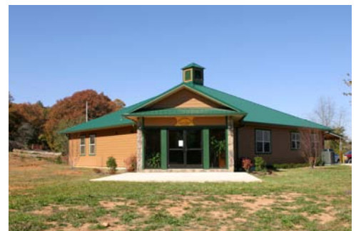
John C Campbell turning studio

The woodturning studio is a fairly new building and is well-equipped with about a dozen Powermatic 3520B lathes. The lathes are sold each year and replaced with new ones. The class I took was entitled “Firewood to Fine Art” and was limited to bowl turning. Instruction started with a tool sharpening session that concluded with everyone sharpening their bowl gouges, etc. The remainder of that day and most of the next was spent turning shallow bowls from poplar. Each session during the week was preceded by a detailed demonstration of bowl turning with the type of wood we planned to use. We then moved into green wood bowl turning for a couple of days. Bobby Clemons had us take the green wood bowls to completion so we would know how to finish them. We then turned a natural edge bowl from a half section of a small log.